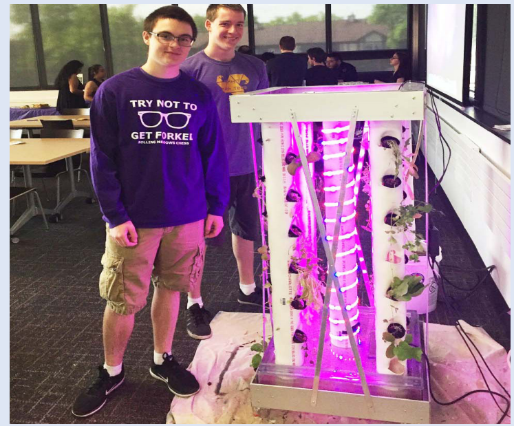
Students at Rolling Meadows High School designed and developed a hydroponics garden using grant monies from the Cook County Farm Bureau Food Science Grant. Their "Unbound Project" combined several classes in a cross-curricular experience with agriculture as the focus.

Cook County teachers in middle and high schools are encouraged to contact the Ag Literacy Coordinator to learn about new grant opportunities available beginning 9/1/17 for use in the 2017-18 school year.