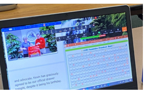
Cook County Farm Bureau staff provided behind the scenes technology support for the Drawdown event providing the opportunity for members and ticket purchasers to watch the event live.

Members interested in viewing the recording of the event can access it at: https://cookcfb.org/ foundation/ccfb-foundation-drawdown-for-ageducation-fundraiser.