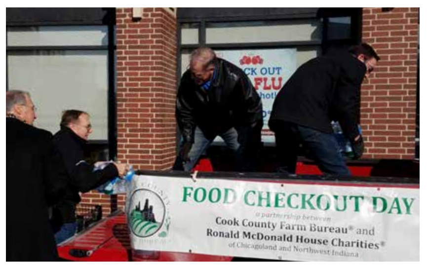
Cook County Farm Bureau volunteers loaded food collected from this year's Food Checkout Day scavenger hunt. Together with sponsors and Country Financial representatives, Farm Bureau donated over $8,000 to Ronald McDonald House Charities.

Creating a Farm Enterprise: $$$'s in Your Yard Workshop at the Cook County Farm Bureau® -Rescheduled Date- Saturday, April 14, 2018 9:00am - Noon