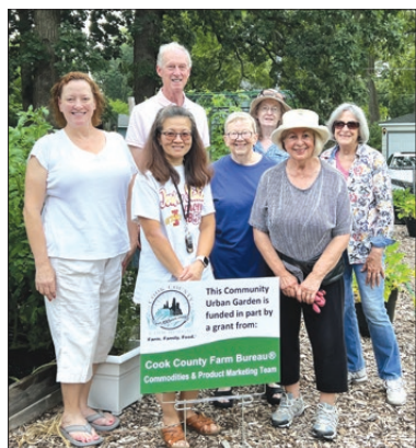
Left, Dunning Garden Above, TriVillage Garden