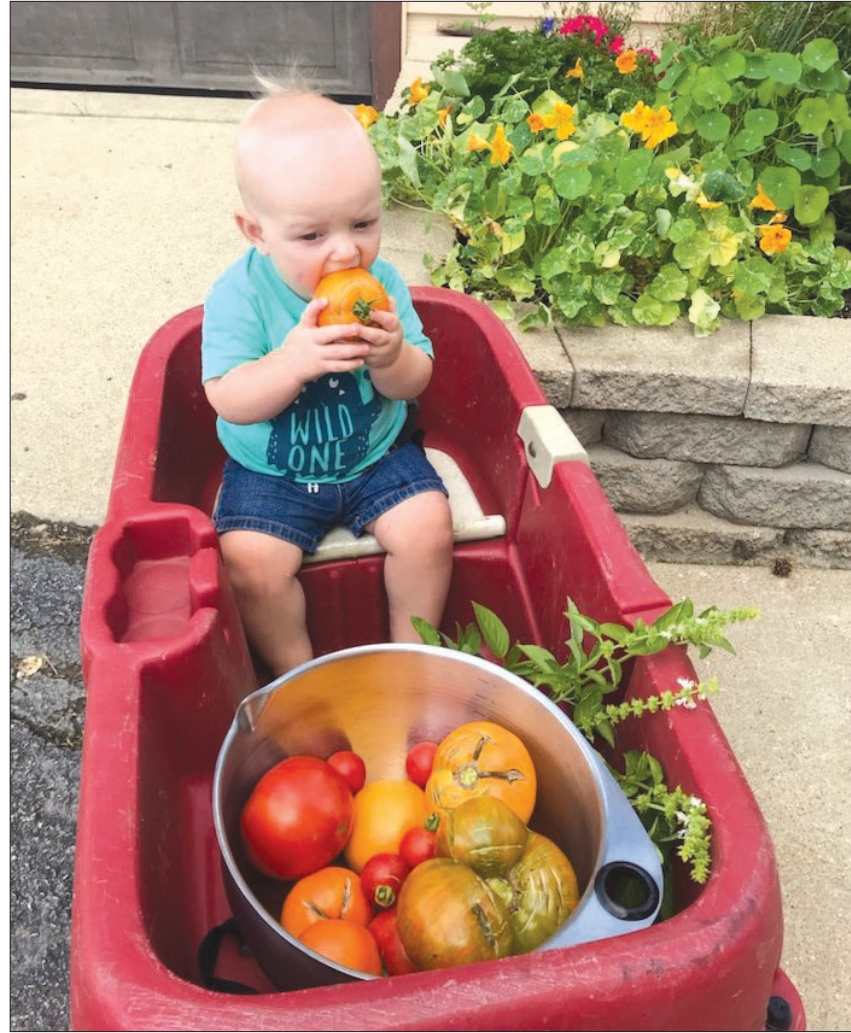
1st Place Winner: "Grandson enjoying fresh-picked tomato!!" by Wanda Bruinsma

*Farm Bureau Farm Fresh Funds are funds that can be redeemed at local member farmstands, greenhouses and garden centers just as you would use cash.