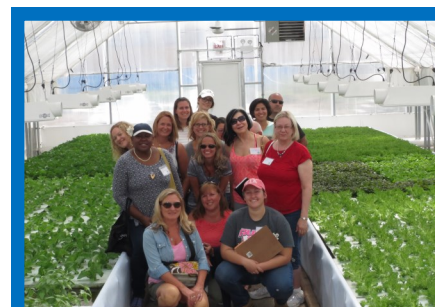
Teachers experience hands on agriculture.