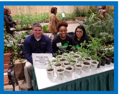
2 students started a potted flower business with support from the Foundation and Compeer Financial Grant.

"Agriculture grows our food and is very important to the state of Illinois."