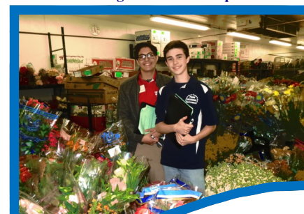
Students learn leadership skills.