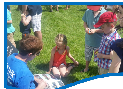
Kids love learning more about farming!