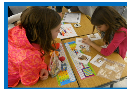
Kids match grains with final products.