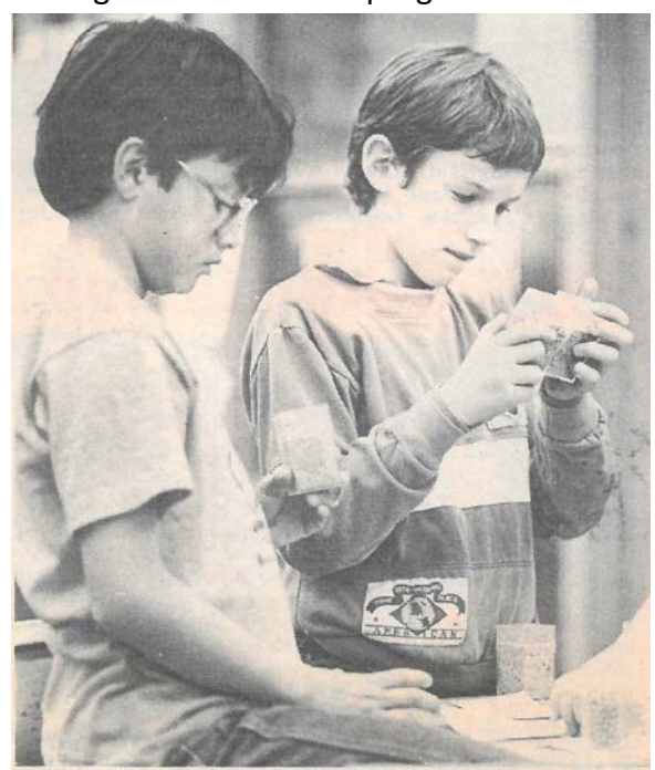
Two boys compare different farm grains. They identify 13 grains and learn food products that are made from them.

The Ag in the Classroom program reached 3083 students