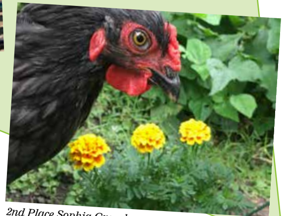
2nd Place Sophia Grande