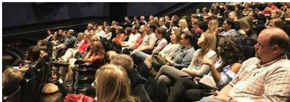
Most of the “Food Evolution” audience remained after the hour-and-a-half-long screening for an additional 45-minute discussion about the film, food and farming.

Illinois Farm Families (IFF), CIFT and the Illinois Science Council co-sponsored the Chicago event. The Cook County Farm Bureau promoted it to members to attend. Illinois Farm Bureau, which is part of IFF, plans to work with USFRA, county Farm Bureaus and collegiate Farm Bureau chapters on additional screenings throughout the state.