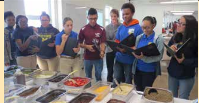
Gourmet Gorilla provided the fresh ingredients for the Iron Chef competition.