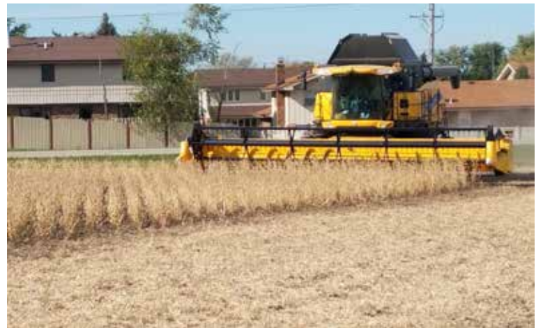
Corn and soybean harvest is in full swing in the northeastern corner of the state. Please take special care in traveling the roads when you come upon farm equipment. It is large in size, travels slowly, and makes left turns, sometimes without a signal. In a car versus farm equipment accident, the car usually loses.

P.S. For more information, please access www.cookcfb.org and checkout the "Who We Are" video and the Country Financial Connection history.