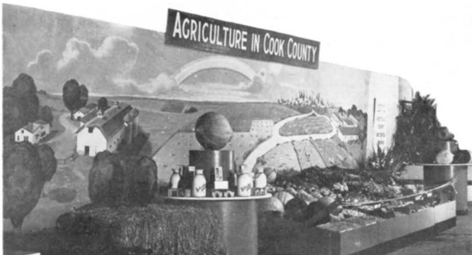
This Cook County Farm Bureau display featured dairy, vegetable, and grain farms. Where was this display used in 1949?

Answers (if not at the tip of your tongue) are available online at cookcfb.org/ccfb/ourhistory . Call the Farm Bureau at 708-354-3276, fax your answer to 708-579-6056, or email fbcooperator@gmail.com to enter the drawing for a $25 gas