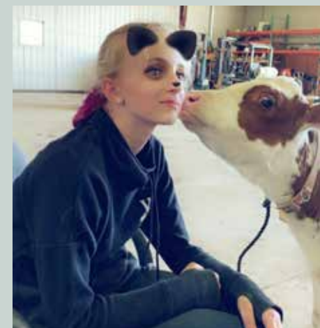
“Applecrisp” exploring her new role of show calf.

her around “Lickey” would escape. Through fences. Over fences. Through windows. Needless to say, “Lickey” earned her registered name... “Lickety Split”.