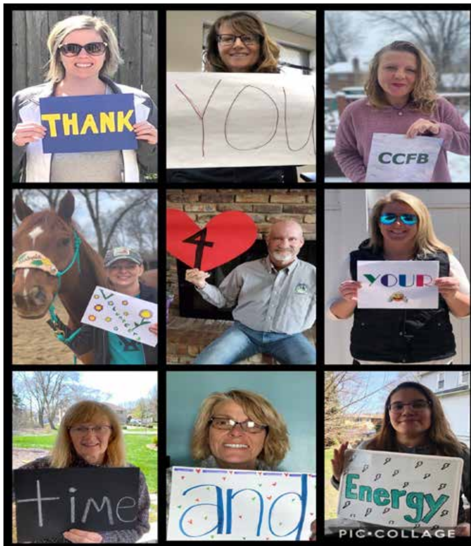
The collage above was posted on the Cook County Farm Bureau Facebook page recently. April 19 through the 26th was National Volunteer Appreciation Week. The Cook County Farm Bureau depends on, values and appreciates our many volunteers that provide such a wide range of support and dedication to area agriculture and Farm Bureau membership. We celebrate members that provide strategic vision, organizational enthusiasm, online communications to elected officials, support of our many programming and ag literacy efforts and so much more. In celebration and recognition of our many volunteers, the Cook County Farm Bureau provided a donation to the Greater Chicago Food Depository.