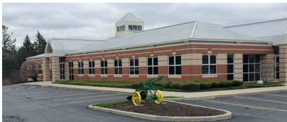
The Cook County Farm Bureau building is looking lonely with limited access to tenants and staff during the COVID-19 stay at home order.