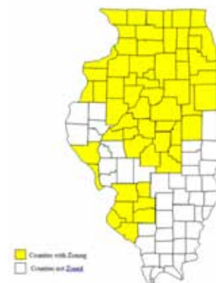
Illinois Counties Zoned

Limiting the impacts and restrictions zoning has on agriculture helps to maintain the viability of ag industry statewide. Still, counties that have zoning and those that are considering zoning deal with difficult decisions impacting all property. While zoning may or may not be a “four-letter” word, it does create both limitations and benefits. Balancing those is key to its acceptance as an effective administrative tool for providing for the general welfare of the citizens of the county.