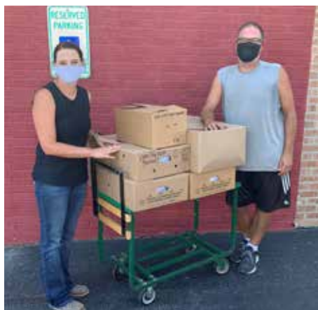
Together We Cope