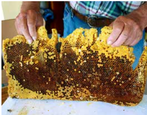
Even the bees feeling the COVID Effect?

A couple of months ago, a bike shop owner I know reported that the availability of new bikes in the $500 and under price range were nonexistent throughout the world. Demand went through the roof during shelter at home. Is it my imagination or are there more people out biking than ever before? The COVID Effect?