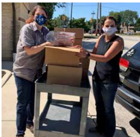
Elk Grove Township Food Pantry

after Farm Bureau leaders purchased the animals from local 4-H members during the Lake County Fair Virtual 4-H Auction.