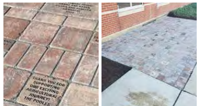
Snap shot of the Centennial Legacy Patio

CENTENNIAL LEGACY PATIO CREATED TO BENEFIT FOUNDATION A COMMEMORATIVE LEGACY PATIO IN HONOR THE FIRST 100 YEARS OF CCFB SERVICE TO MEMBERS To mark the Centennial celebration of the Cook County Farm Bureau, the Farm Bureau and Foundation partnered to create a Commemorative Patio on the grounds of the Cook County Farm Bureau. The Commemorative Patio is close to the east entrance of the Farm Bureau building and features personalized memory pavers, three park benches, a wrought iron fence, and flower boxes. Members and Farm Bureau/Foundation supporters and partners can still support the project by purchasing a paver that will be incorporated into the patio. The paver can include the member or family name, encouragement, recognition, and other well wishes. Three sizes of paver are available and proceeds from the sale of the pavers go directly to the Cook County Farm Bureau Foundation's efforts to improve and enhance agricultural literacy in Cook County. Donation for the pavers are fully deductible per IRS guidelines. Go to www.cookcfb.org for order form or to donate.