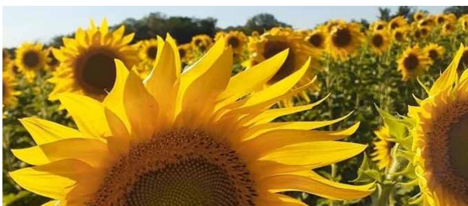
Fall flowers and vegetables abound in Cook County, share what you have growing in your garden at https://www.facebook.com/Cook.County.Farm.Bureau.IL