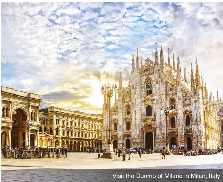
Visit the Duomo of Milano in Milan, Italy