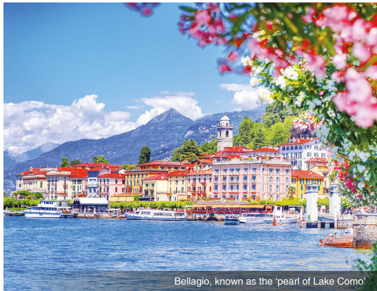
Bellagio, known as the 'pearl of Lake Como'

DAY 1 Depart the USA: Depart the USA on an overnight flight to Milan, Italy.