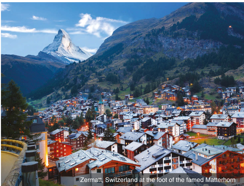
Zermatt, Switzerland at the foot of the famed Matterhorn

photographed mountain and symbol of Switzerland. From the viewing platform at the summit, fresh mountain air and awe-inspiring views across the Swiss Alps await! Return to the base of the mountain via cable car and relax in town for the remainder of the day. Meal: B