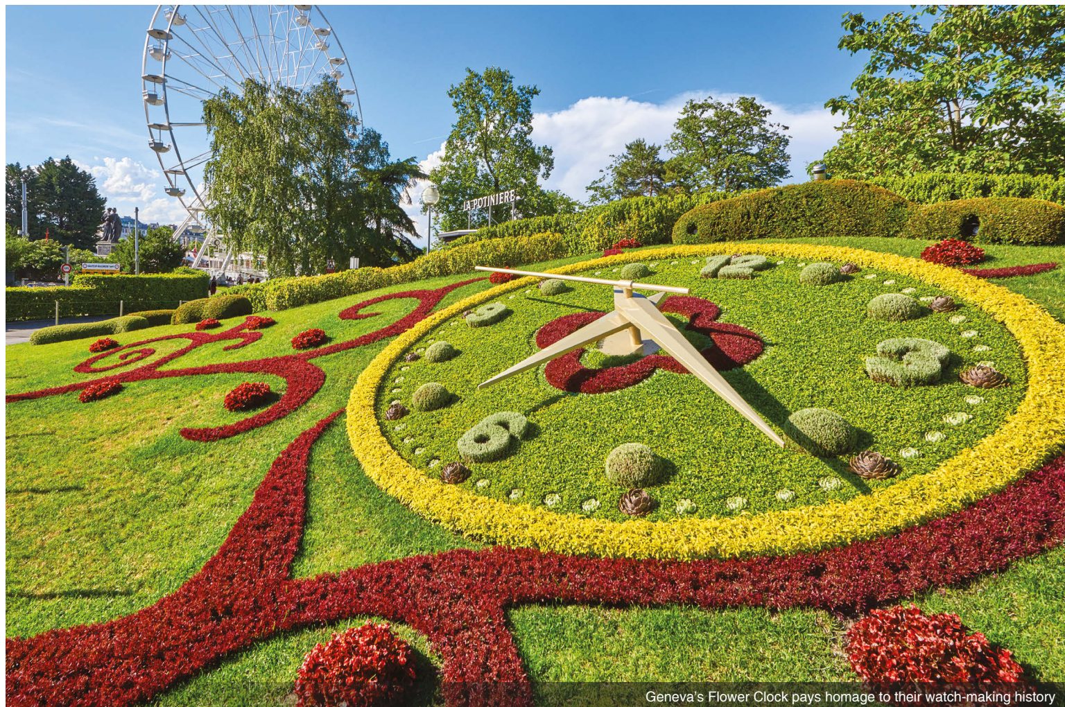
Geneva's Flower Clock pays homage to their watch-making history