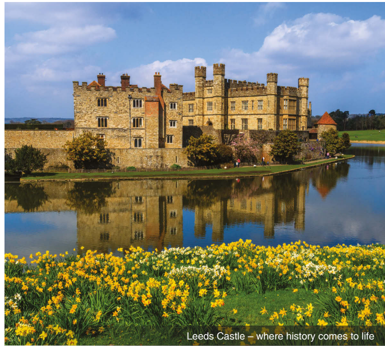
Leeds Castle – where history comes to life

DAY 1 Depart the USA: Depart the USA on your overnight flight to London, England.