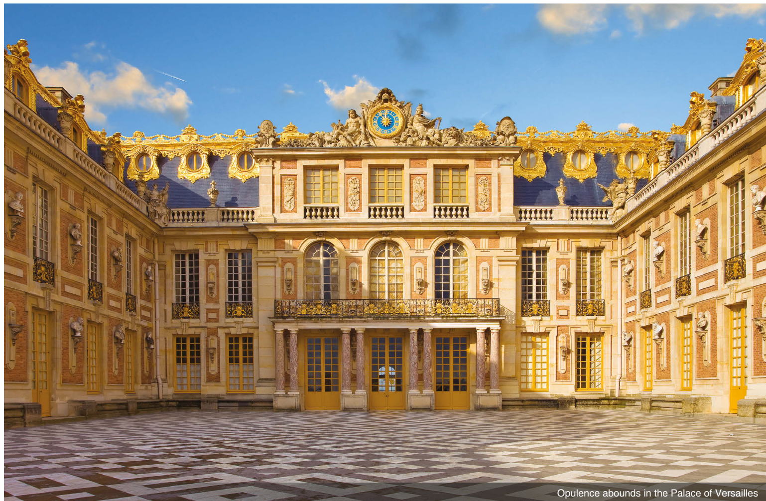
Opulence abounds in the Palace of Versailles