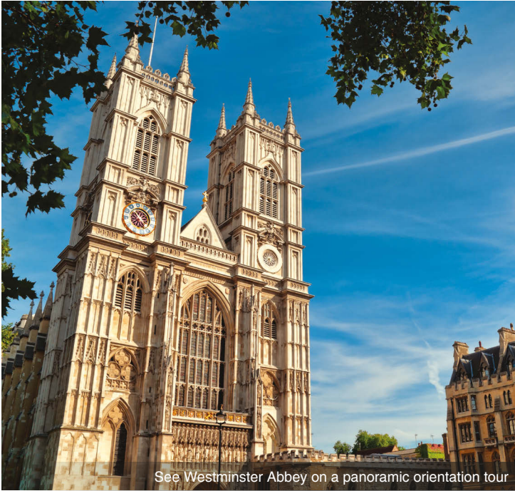
See Westminster Abbey on a panoramic orientation tour