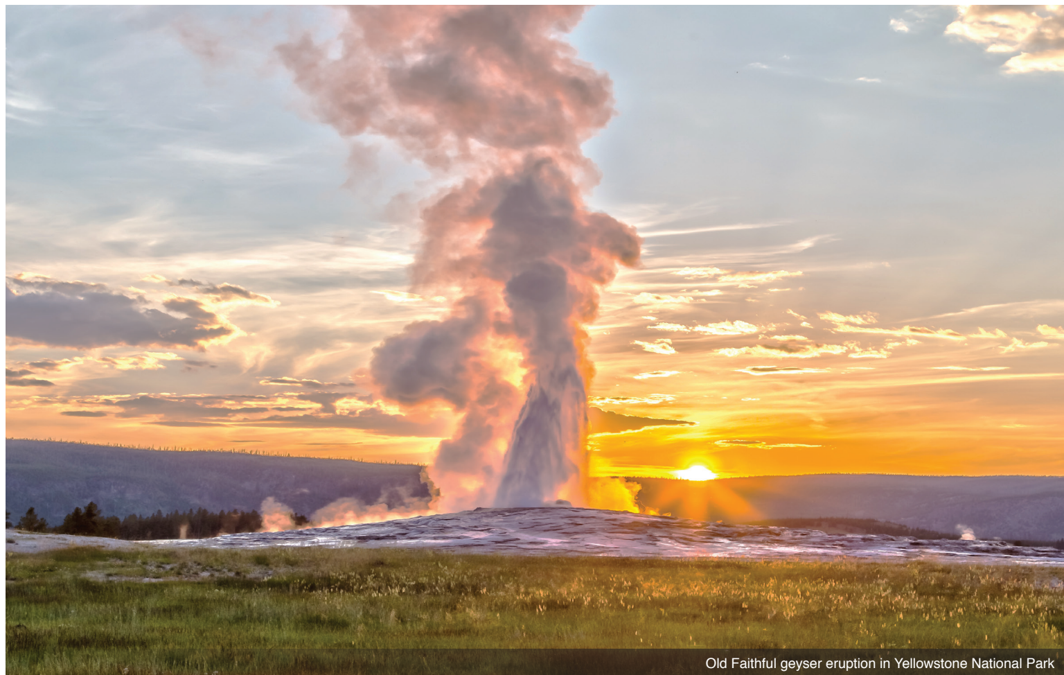
Old Faithful geyser eruption in Yellowstone National Park