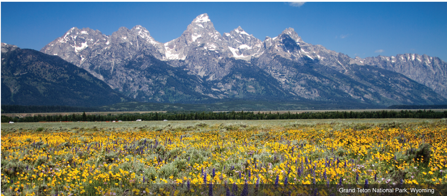
Grand Teton National Park, Wyoming

Norris Geyser Basin, filled with an incredible variety of steam vents, mud pots, geysers, and hot springs, before returning to your park lodge for dinner this evening. Meals: B, D