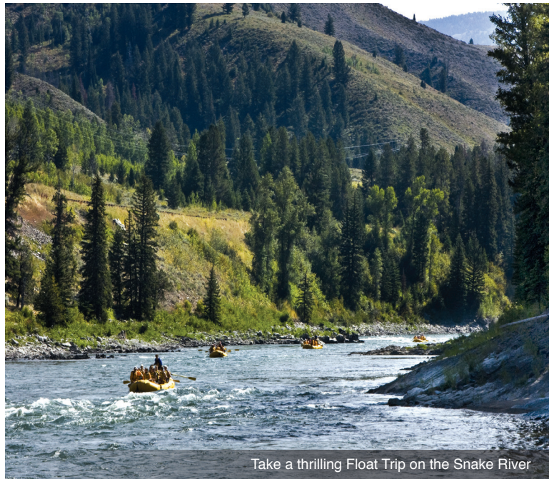
Take a thrilling Float Trip on the Snake River